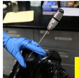
TEMPERATURE AFTER SPRAY